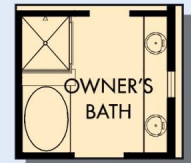
OPTIONAL SLIP-IN TUB WITH SEPARATE SHOWER AT OWNER'S BATH