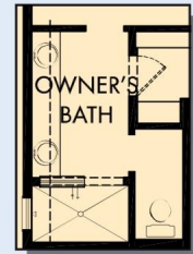
OPTIONAL WALK-IN SHOWER AT OWNER'S BATH