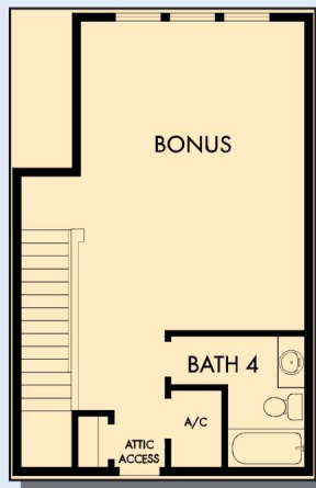
OPTIONAL SECOND FLOOR BONUS WITH BATH 4

For additional options, please visit DavidWeekleyHomes.com