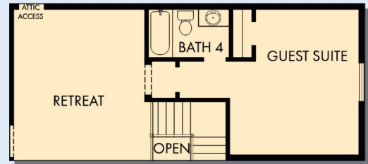
OPTIONAL GUEST SUITE WITH BATH 4 AT RETREAT