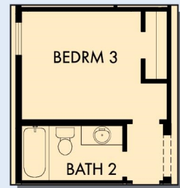
OPTIONAL BEDROOM 3 AT STUDY