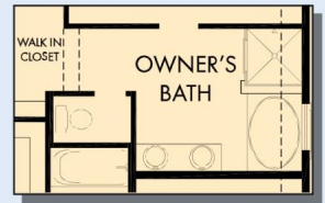
OPTIONAL SLIP-IN TUB WITH SEPARATE SHOWER AT OWNER'S BATH