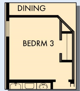
OPTIONAL BEDRM 3 AT STUDY