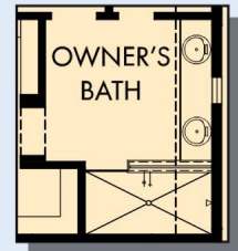
OPTIONAL WALK-IN SHOWER AT OWNER'S BATH