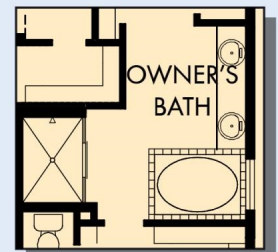
OPTIONAL DROP-IN TUB AND SEPARATE SHOWER AT OWNER'S BATH