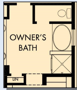
OPTIONAL TUB AND SHOWER AT OWNER'S BATH