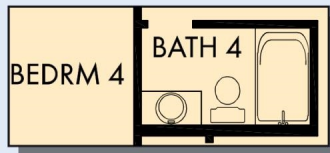
OPTIONAL BATH 4