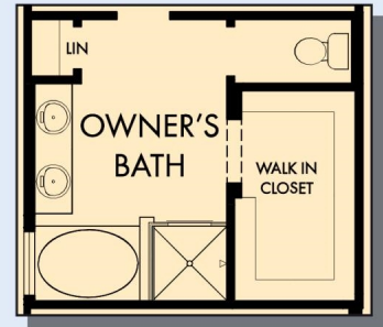
OPTIONAL SLIDE IN TUB WITH SEPARATE SHOWER AT OWNER'S BATH