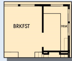
OPTIONAL POCKET OFFICE AT BREAKFAST