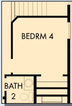
OPTIONAL BEDROOM 4 AT RETREAT