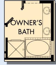
OPTIONAL DROP-IN TUB WITH SEPARATE SHOWER AT OWNER'S BATH