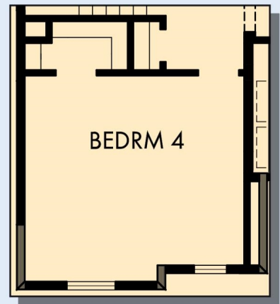
OPTIONAL BEDROOM 4 AT RETREAT

For additional options, please visit DavidWeekleyHomes.com