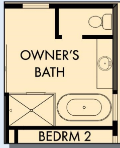
OPTIONAL FREE- STANDING TUB WITH SEPARATE SHOWER AT OWNER'S BATH