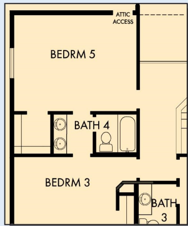
OPTIONAL BEDROOM 5 AND BATH 4 AT MEDIA