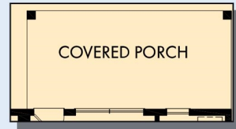
OPTIONAL COVERED PORCH