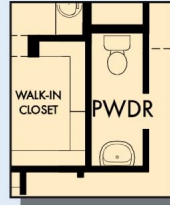
OPTIONAL POWDER BATH AT HALL WAY

3,536 - 3,671 sq. ft. • 5 Bedrooms • 4 Full Baths • 3 Car Garage