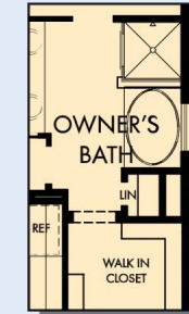
OPTIONAL SLIP IN TUB WITH SEPARATE SHOWER AT OWNER'S BATH