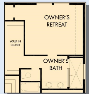
OWNER'S RETREAT OPTIONAL WALK-IN SHOWER AT OWNER'S BATH