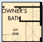
OWNER'S BATH OPTIONAL SHOWER AT OWNER'S BATH