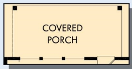
COVERED PORCH OPTIONAL COVERED PORCH

2,234 - 2,290 sq. ft. • 4 Bedrooms • 3 Full Baths • 2 Car Garage