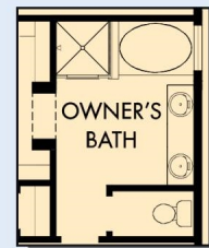
OPTIONAL SLIDE-IN TUB WITH SEPARATE SHOWER AT OWNER'S BATH