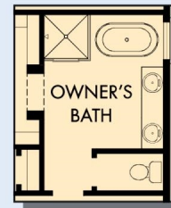
OPTIONAL DROP-IN TUB WITH SEPARATE SHOWER AT OWNER'S BATH