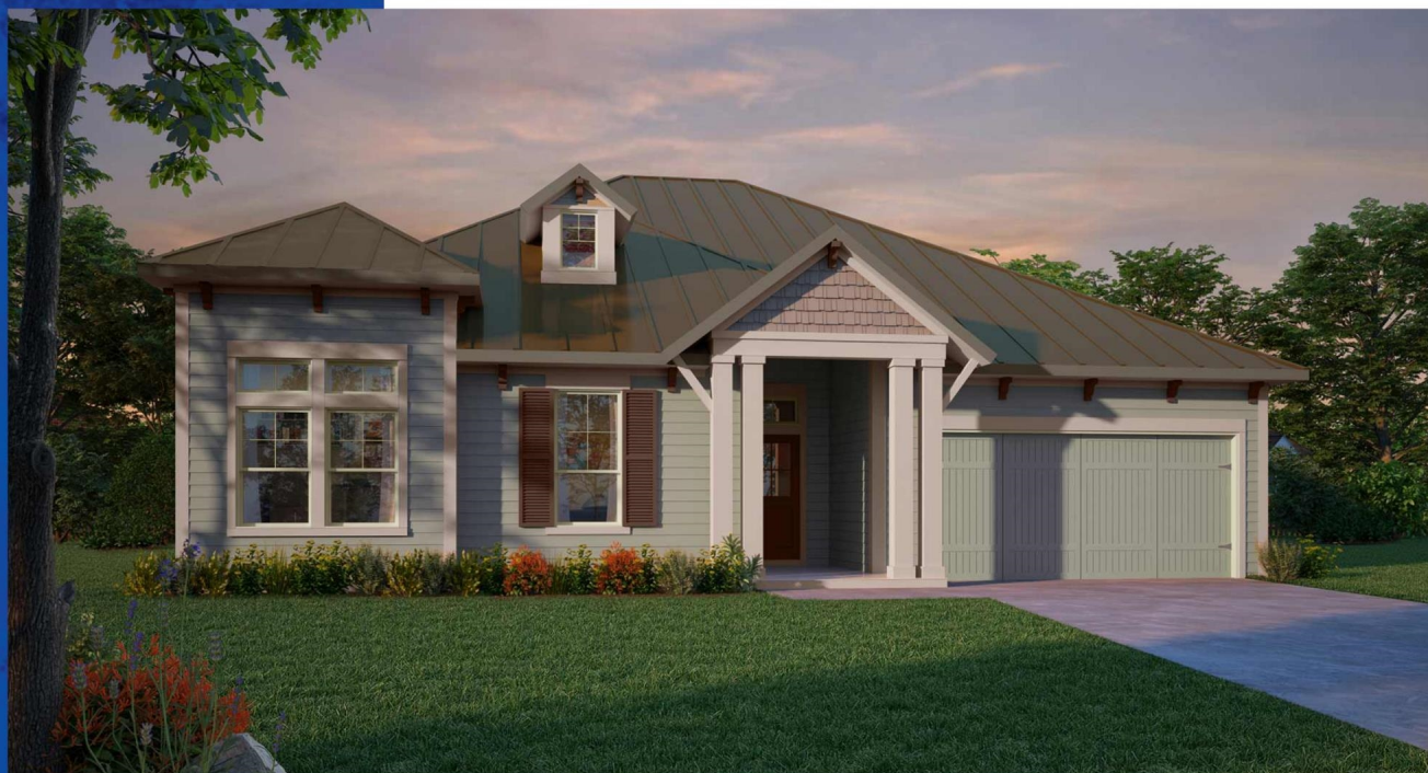
2161 HOU - A