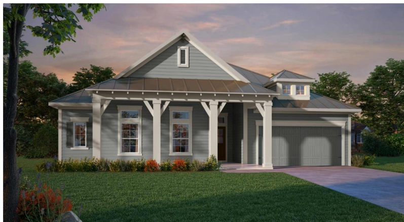
2161 HOU - B