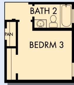
OPTIONAL BEDROOM 3 AT STUDY