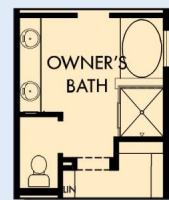
OPTIONAL SEPARATE TUB AND SHOWER AT OWNER'S BATH