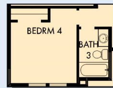
OPTIONAL BEDROOM 4 WITH BATH 3 AT STUDY