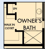
OPTIONAL SHOWER AT OWNER'S BATH