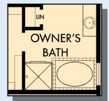
OPTIONAL DROP-IN TUB WITH SEPARATE SHOWER AT OWNER'S BATH