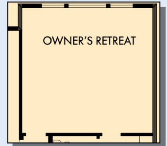
OPTIONAL EXTENDED OWNER'S RETREAT