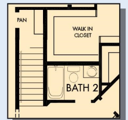
FIRST FLOOR WITH OPTIONAL SECOND FLOOR BONUS