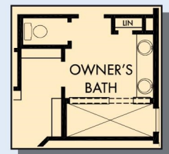
OWNER'S BATH OPTIONAL SUPER SHOWER AT OWNER'S BATH