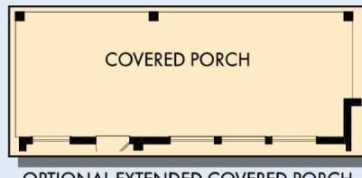
COVERED PORCH OPTIONAL EXTENDED COVERED PORCH AT FAMILY AND BREAKFAST