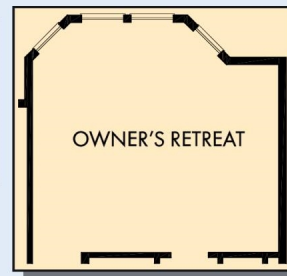
OWNER'S RETREAT OPTIONAL BAY WINDOW AT OWNER'S RETREAT