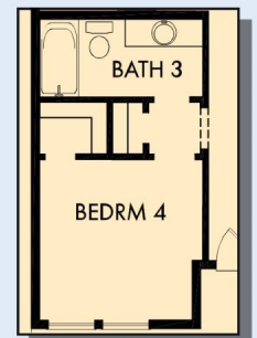
OPTIONAL BEDROOM 4 WITH BATH 3 AT STUDY