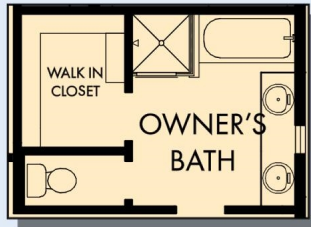
OPTIONAL TUB AND SHOWER AT OWNER'S BATH