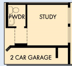
OPTIONAL POWDER BATH AT STUDY