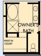
OWNER'S BATH OPTIONAL SLIP IN TUB WITH SEPARATE SHOWER AT OWNER'S BATH