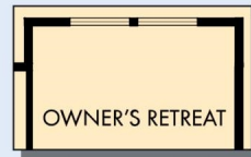
OWNER'S RETREAT OPTIONAL EXTENDED OWNER'S RETREAT

2,678 - 3,093 sq. ft. • 4 Bedrooms • 2 - 3 Full Baths • 1 Half Bath • 2 - 3 Car Garage