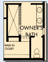
OWNER'S BATH OPTIONAL SUPER SHOWER AT OWNER'S BATH