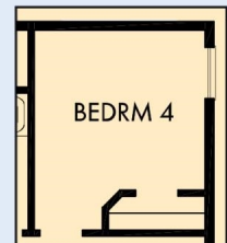
OPTIONAL BEDRM 4 AT RETREAT