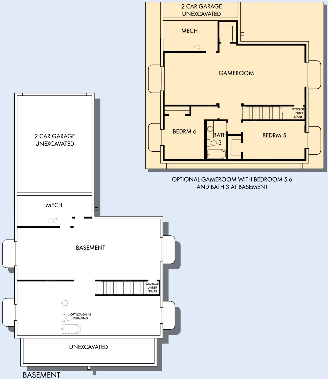
OPTIONAL GAMEROOM WITH BEDROOM 5,6 AND BATH 3 AT BASEMENT

For additional options, please visit DavidWeekleyHomes.com