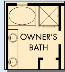
OPTIONAL SLIDE-IN TUB AND SHOWER AT OWNER'S BATH