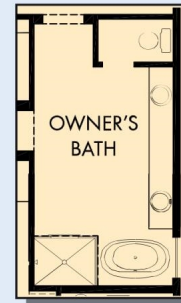
OPTIONAL FREE-STANDING TUB WITH SEPARATE SHOWER AT OWNER'S BATH