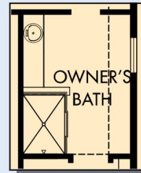
OPTIONAL SHOWER 2 AT OWNER'S BATH