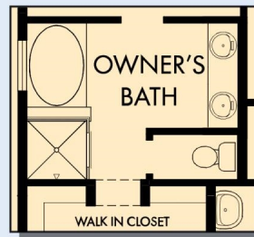
OPTIONAL SLIP-IN TUB WITH SEPARATE SHOWER AT OWNER'S BATH