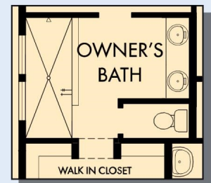
OPTIONAL SUPER SHOWER WITH AT OWNER'S BATH