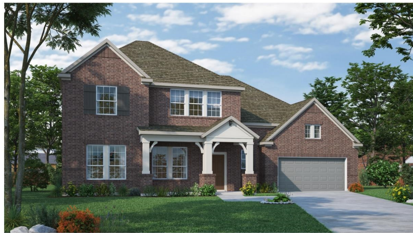
6564 DAL - B