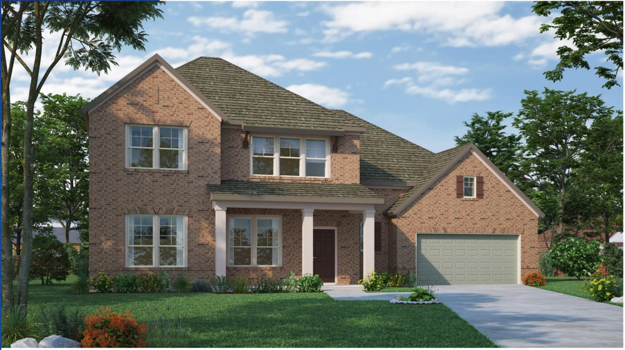
6564 DAL - A