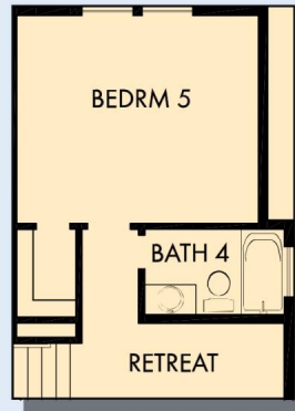
OPTIONAL BEDROOM 5 WITH BATH 4 AT RETREAT