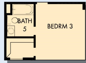
OPTIONAL BATH 5 AT BEDROOM 3