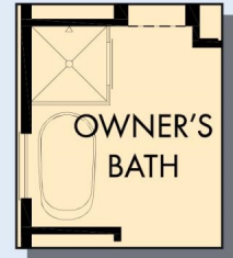
OPTIONAL FREE STANDING TUB AND SHOWER AT OWNER'S BATH