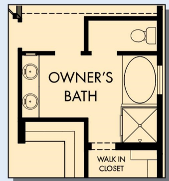
OPTIONAL SLIP IN TUB WITH SEPARATE SHOWER AT OWNER'S BATH