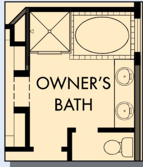
OPTIONAL DROP IN TUB WITH SEPARATE SHOWER AT OWNER'S BATH