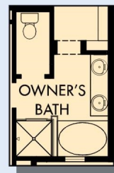
OPTIONAL SEPARATE TUB AND SHOWER AT OWNER'S BATH