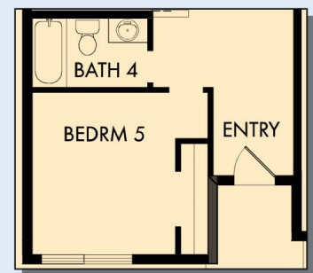
OPTIONAL BEDROOM 5 WITH BATH 5 AT STUDY