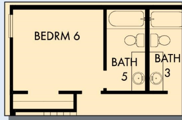
OPTIONAL BEDROOM 6 WITH BATH 5 AT RETREAT