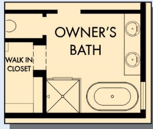
OPTIONAL FREE STANDING TUB WITH SHOWER AT OWNER'S BATH