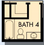
OPTIONAL BATH 4 AT CLOSET