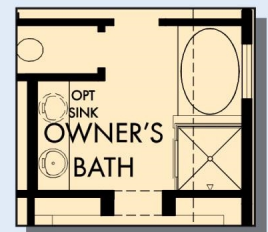
OPTIONAL SLIP IN TUB WITH SEPARATE SHOWER AT OWNER'S BATH