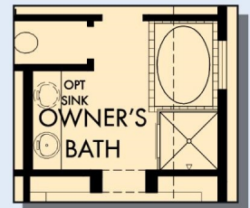
OPTIONAL DROP-IN TUB WITH SEPARATE SHOWER AT OWNER'S BATH