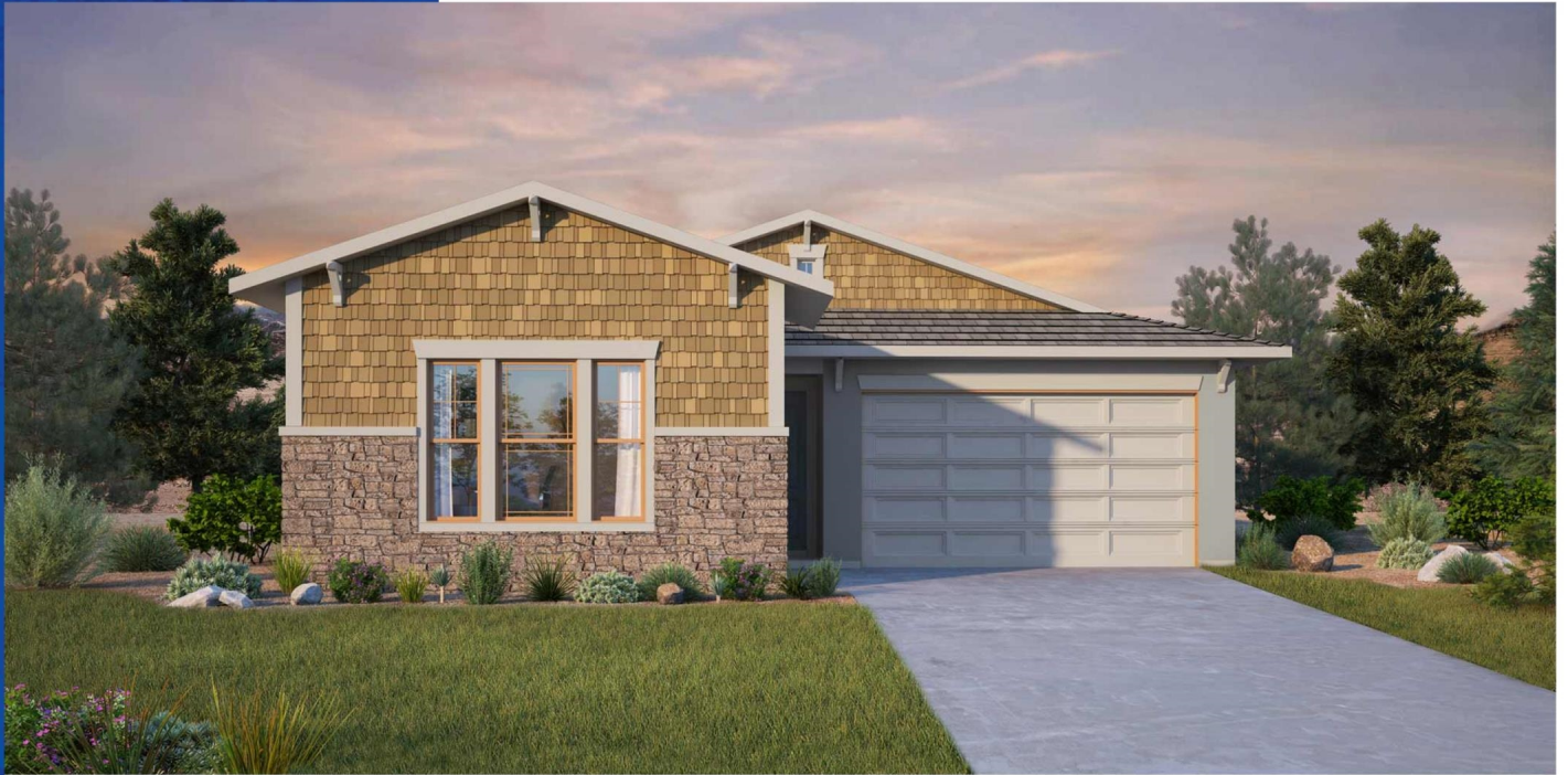
7660 PHO - D