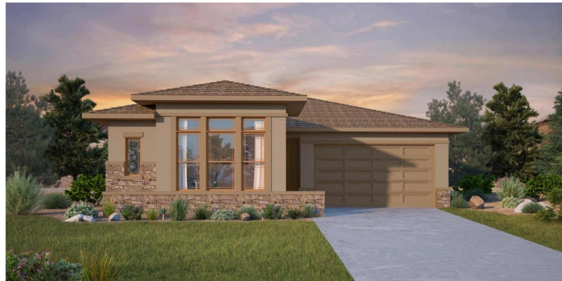
7660 PHO - E