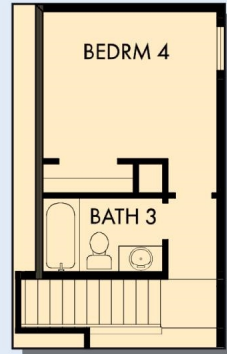
OPTIONAL BEDROOM 4 WITH BATH 3