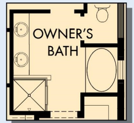
OPTIONAL SLIDE-IN TUB WITH SEPARATE SHOWER AT OWNER'S BATH