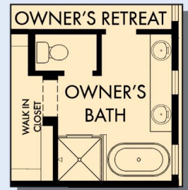
OPTIONAL FREE-STANDING TUB WITH SEPARATE SHOWER AT OWNER'S BATH