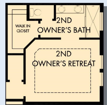
OPTIONAL 2ND OWNER'S RETREAT AT BEDROOMS 3 AND 4